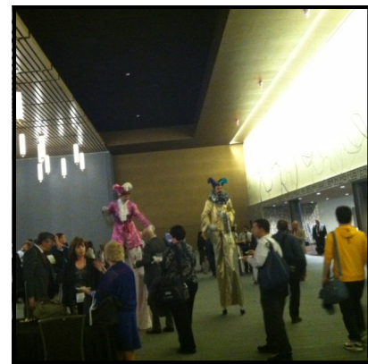
Mardi Gras themed Communities Open House

The HIMSS Louisiana chapter sponsored several functions during the HIMSS Annual Conference and Exhibition. A social gathering was held at The Attic at Lucy's Retired Surfers Bar and Restaurant.