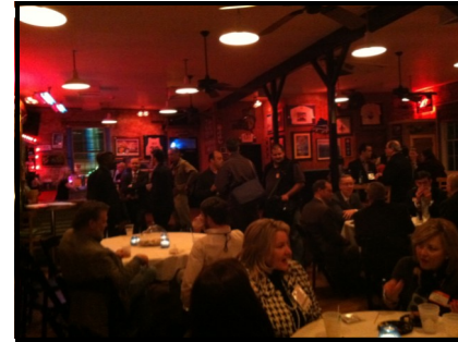
LaHIMSS Social at The Attic at Lucy's Retired Surfers Bar and Restaurant