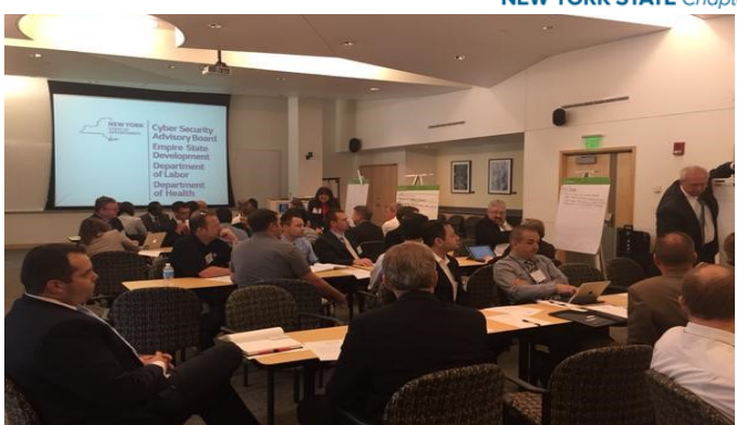
HIMSSNYS Chapter Members at Healthcare Cybersecurity Roundtable— University of Buffalo August 5th