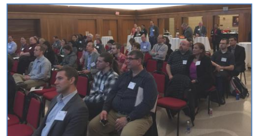
Event attendees listening to Oracle's cybersecurity presentation

...and we hope to see you at one in the coming year! 2016-2017 event dates coming soon!