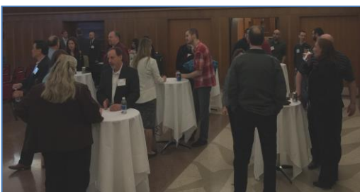
Attendees networking prior to the event