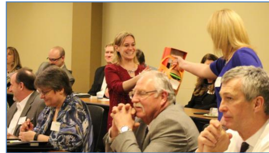
An excited door prize recipient