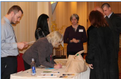
Event registration volunteers hard at work