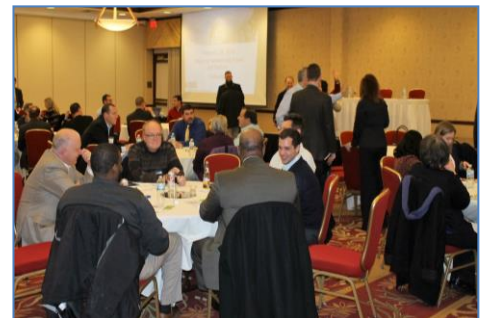
Attendees networking at our February event