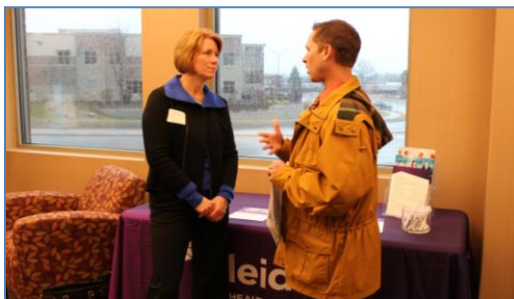
Chatting with sponsors